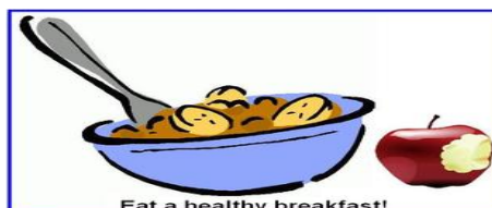
Eat a healthy breakfast!

Please see reverse side of menu for additional offerings.